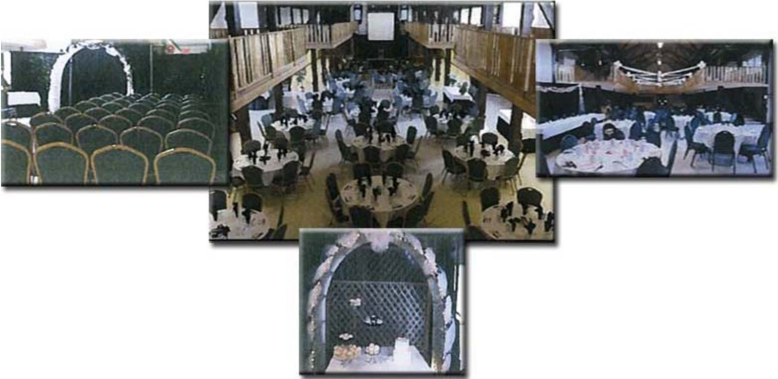
HERITAGE HALL 6,533 sq ft lower floor